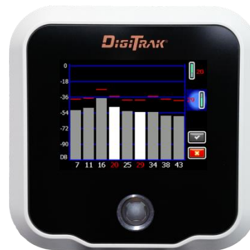
Falcon Frequency Optimizer

Using the F5 receiver's familiar menus and navigation, the Falcon frequency optimizer scans for noise between 4.5 kHz and 45 kHz. Upon completing the scan, the receiver displays a simple chart that depicts the noise levels across several bands. Select the two quietest bands and pair with the Falcon wideband transmitter. In areas with varied interference, switch between bands to stabilize data readings and complete the bore. For extreme interference, engage Max Mode for maximum performance.